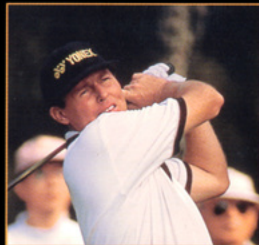
SCOTT HOCH WINNER OF SEVEN PGA TOUR EVENTS