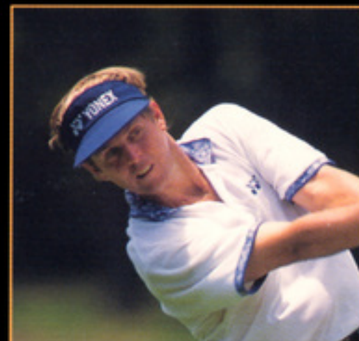
WAYNE LEVI WINNER OF 12 PGA TOUR EVENTS