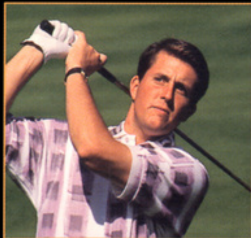
PHIL MICKELSON #1 IN PGA TOUR WINS (1996), WINNER BAY HILL INVITATIONAL (1997)

IN KEEPING WITH OUR POLICY OF CONSTANT PRODUCT REFINEMENT, WE RESERVE THE RIGHT TO MAKE PRODUCT CHANGES AT ANY TIME WITHOUT PRIOR NOTICE. ©1997 YONEX CORPORATION.