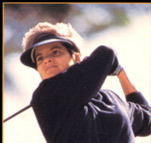
AMY BENZ LPGA TOURING PRO